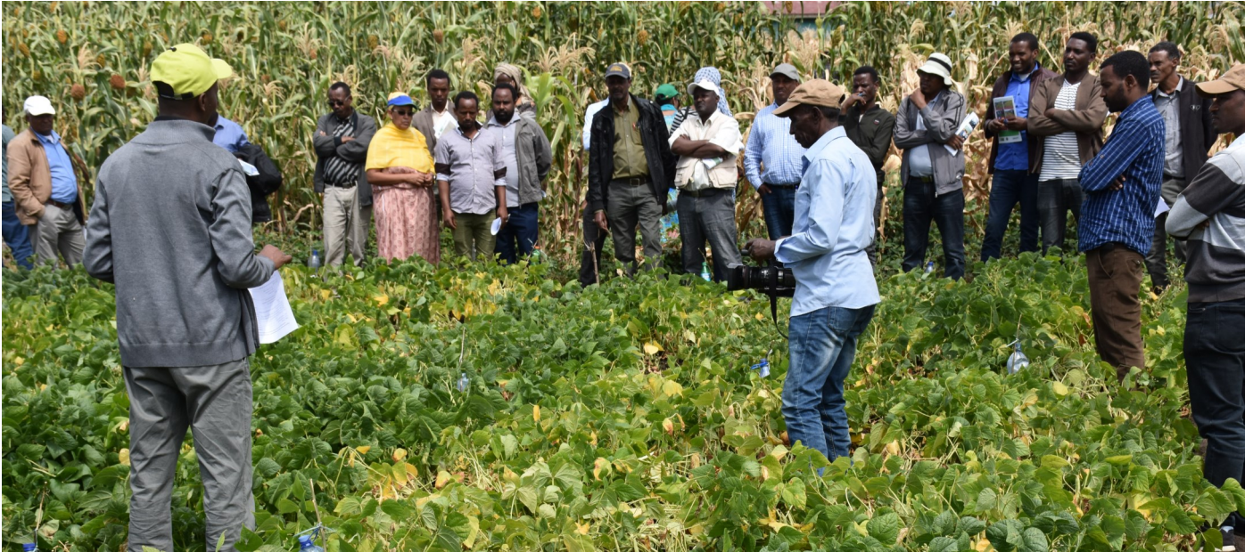
Guyyaa ayaana Qonnaan bultootaatiin muuxannoo yaalii sanyii hirmaachisaa qooda fudhattootaaf qooduu, Aanaa meettaa, Araddaa Duursituu Bilisummaa