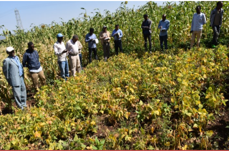
Stakeholders field day organized at Doba woreda, Walkituma Waji Kebele

In addition, different crop varieties of chickpea and teff has been packed and deployed to a total of 600 farmers of which 50% are women in four woredas (Gurawa, Oda Bultum, Doba and Meta). Moreover, score card used for recording farmers preferences and variety traits was developed and shared with development agents and focal persons. Orientation on data management and handling of score card was given to both development agents and woreda focal persons