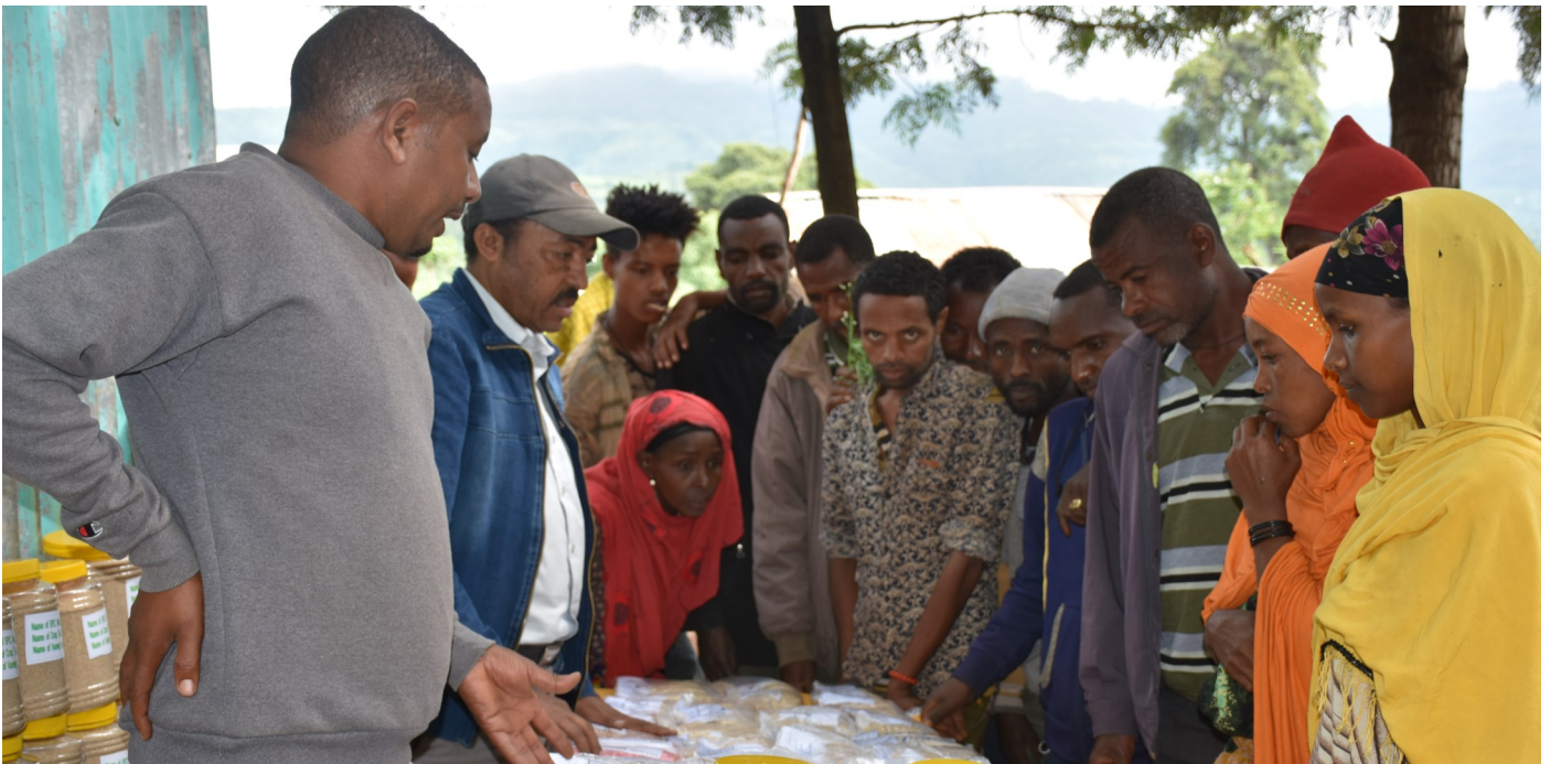
Gabaa sanyii xixiqqaa irratti sanyiiwwan adda addaa beeksisuun fedhii sanyii uumuu, Aanaa Odaa Bultum, Araddaa Odaa Baasotti geggeefame