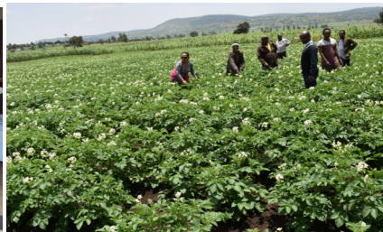
Coaching and supervision made at Haji Faji SPC