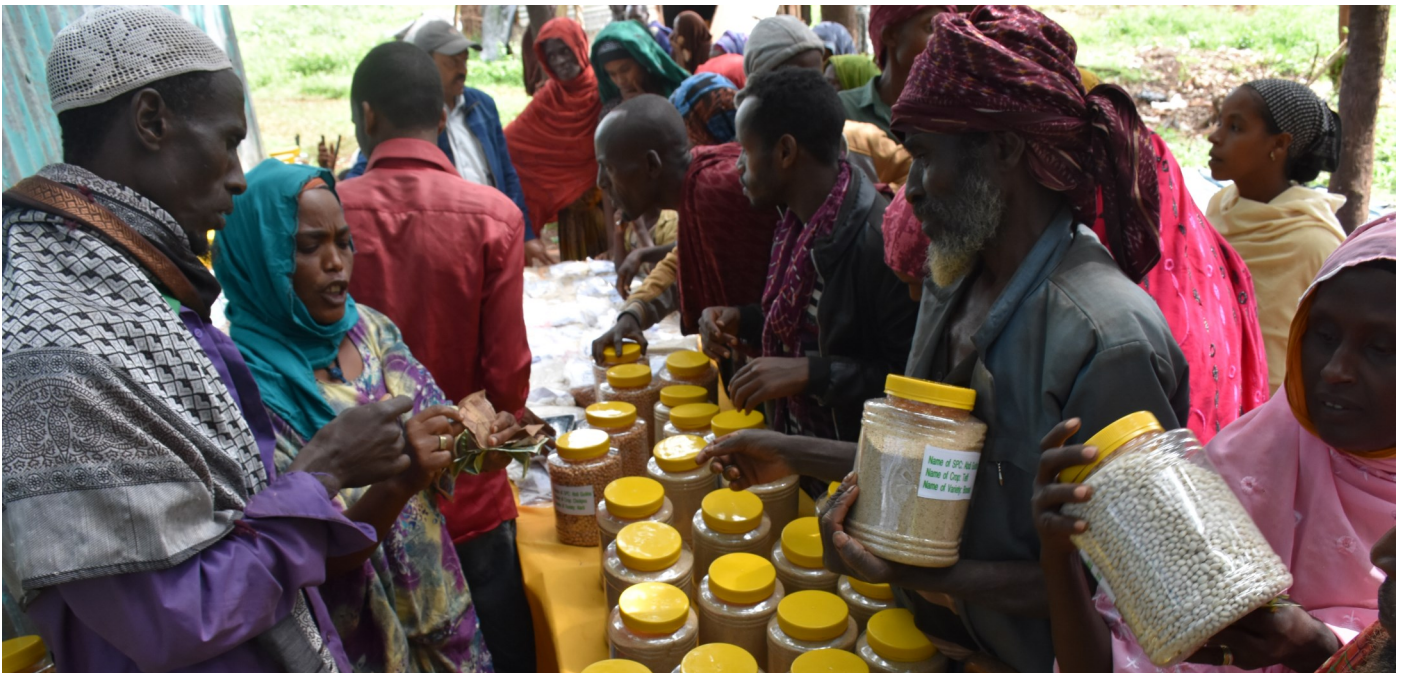
Gabaa sanyii xixiqqaa Aanaa Odaa Bultum, Araddaa Odaa Baasotti geggeefame