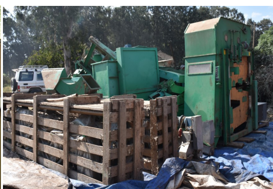
Seed cleaning plant donated for Chercher Oda Bultum Farmers' cooperative Union