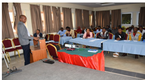
Training provided on business canvass model for partners and SPCs

Under LSB development, supervision and technical backstopping activities was conducted to six direct support SPCs to create awareness on the provision of basic seed of Tef and chickpea and strengthening internal quality seed control activities. Moreover, with collaboration of stakeholder and partners 25 SPCs performance evaluation was conducted by participating 125 executive committee members and 25 DAs using KPI guideline. Finally, One day coaching and technical backstopping was conducted at Abdi Gudina, Misoma Gudina and Burka Gamachu SPCs on the issue of increasing financial capital through internal finance mobilization and increase number of women in the SPCs. A total of 15 executive committee members representing these SPCs were participated. Similarly, with collaboration of partners and stakeholders follow up and monitoring is conducted at 20 indirect SPCs to give technical support on seed sales and marketing strategy and seed production.