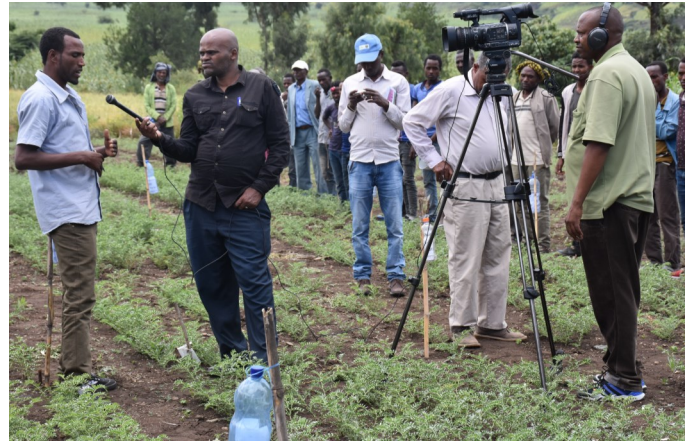
Documenting success stories on the merit of quality seeds during field day