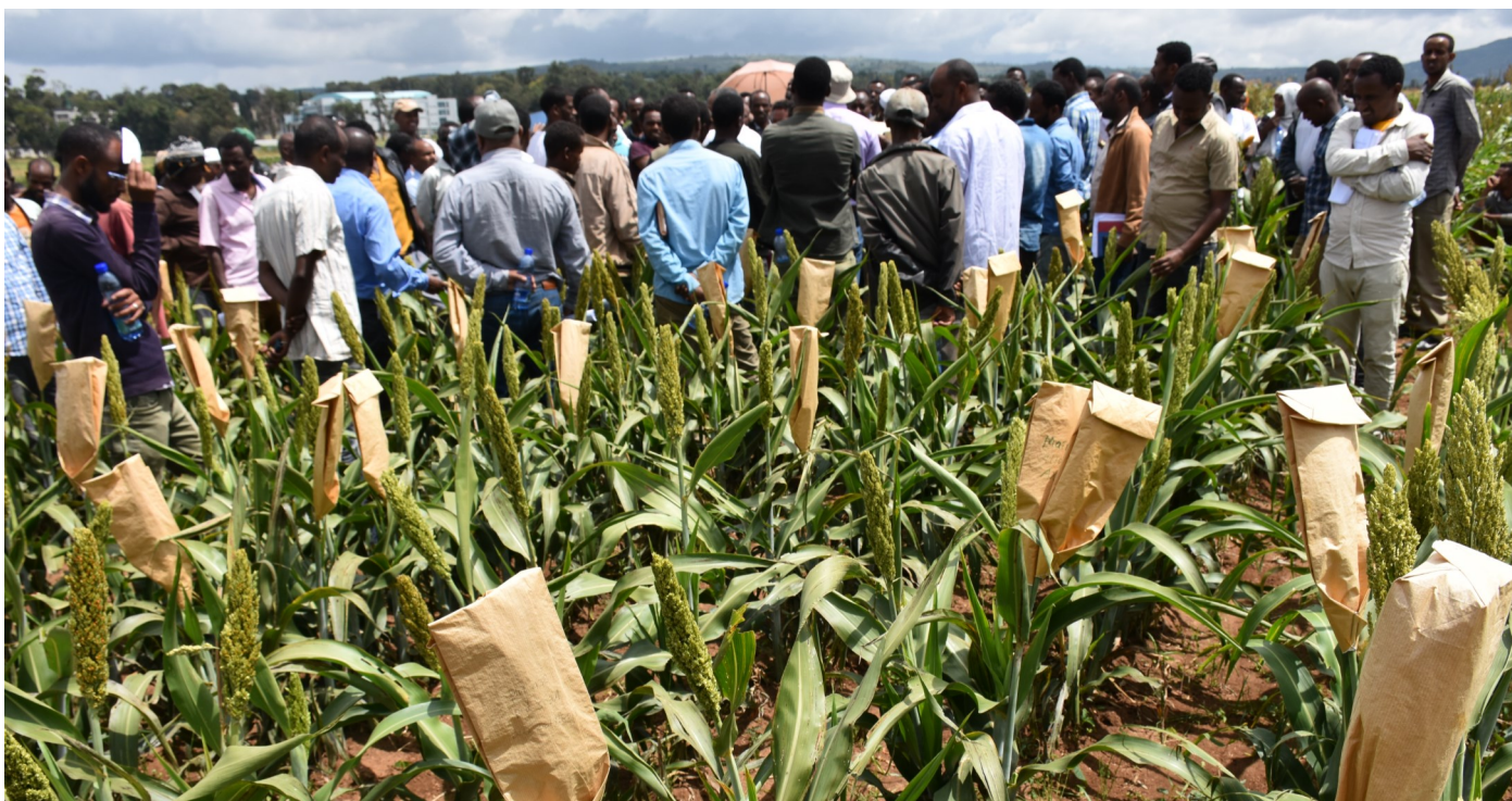
Guyyaa Ayyaana qonnaan bulootaatiin Oomishtoota sanyii haadhoo fi Waldoota oomishtoota sanyii walitti hidhuu, Yuunivarsiitii Haramaayaa