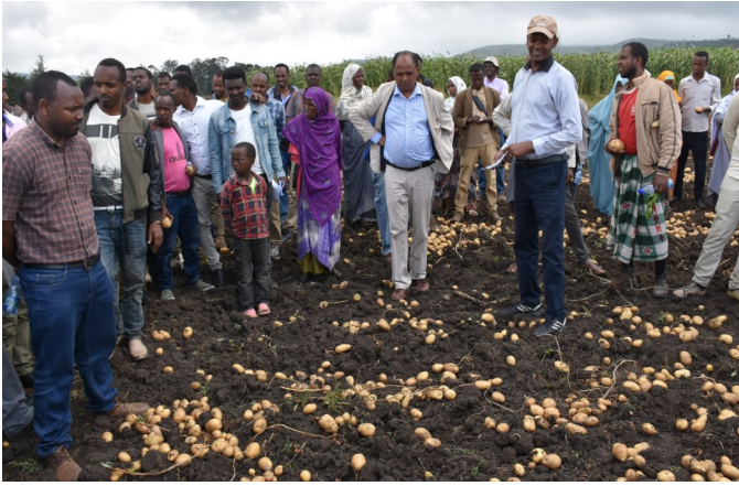
Stakeholder field day organized at HU to link EGS suppliers and seed producers