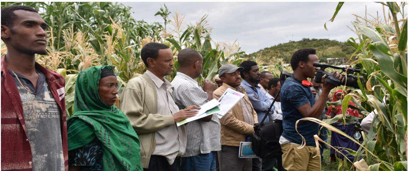
Guyyaa Ayyaana qonnaan bultootaa Aanaa Doobbaa, Araddaa Leenca Waddessaatti qophaa'e

Qabiyyee kana jalatti hojiin biraa hojjatame, sanyiiwwan garagaraa Oomisha gannaa boodaatiin hojjataman kanneen akka xaafii fi shumburaa yaalii sanyii hirmaachisaa (Crowdsourcing fi PVS) geggeessuuf oolan qonnaan bultootaaf raabsameera. Haaluma kanaan sanyiiwwan kunneen qonnaan bultoota 600 (dubartoota 50%) Aanaalee afur jechuunis Aanaa Gurawaa, Odaa Bultum, Doobbaa fi Meettaa keessatti raabsuun yaaliin geggeefamaa jira. Xumura irrattii unkaan (score card) ragaa yaaliiwwan qonnaan bultoota 3000 biratti geggeefaman galmeessuuf oolu qopheessuun, hubannoon waa'ee sassaabbii fi qabinsa ragaa irratti hojjattoota misoomatii fi su-parvaayizarii sadarkaa aanaatiif kennamuun raabsameera.