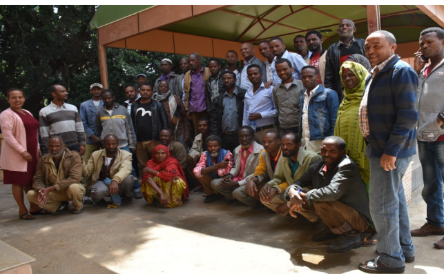
Leenjii karoora modeela daldalaa (business plan canvas) miiltoota pirojeektii ISSDtii fi waldoota Oomishtoota sanyiitiif kenname

Gara biraatiin, guyyaa tokkoof hordoffii fi deeggarsi ogummaa waldaa Oomishtoota sanyii Abdii Guddinaa fi Burqaa Gammachuutiif dhimoota waa'ee kaappitaala keessaa guddisuu, fi hirmaannaa miseensa dubartootaa fooyyessuu irratti laatameera. Hojii kana irratti, koreewwan Waldaa 15 hirmaataniiru. Haaluma walfakkaatuun, miiltota fi qooda fudhattoota waliin tahuudhaan deeggarsi ogummaa dhimmota waa'ee gurgurtaa sanyii, tooftaa gurgurtaa sanyii fi sanyii beeksisuu irratti waldoota 20 al-kallattiin deeggaramaniif kennameera.