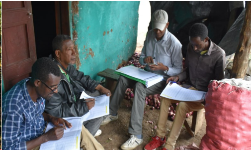
Orientation given for focal persons and development agents on data management