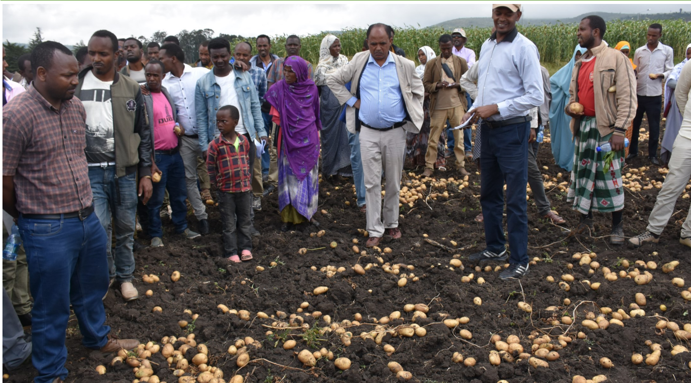
Guyyaa Ayyaana qonnaan bulootaatiin Oomishtoota sanyii haadhoo fi waldoota Oomishtoota sanyii walitti hidhuu, Yuunivarsiitii Haramaayaa