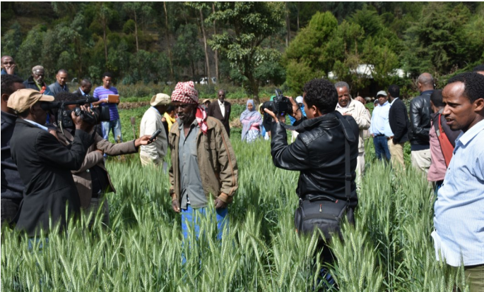
Muuxannoowwan qonnaan bulootaa qopheessuu fi qooduu, Aanaa Kurfaa Callee, Araddaa Jiruu Bal'inaa

Walatajjiin Pirojeektii ISSD sadarkaa naannootti yaad-rimee walitti hidhata dhiheessii fi fedhii sanyii fooyyessuu jedhuun magaalaa Harar hoteela Raasitti guyyaa tokkoof qophaa'eera. Waltajjii kanarratti hirmaatootni 45 jechuunis waajjiralee qonnaa fi hojii gamtaa godinaalee fi aanaalee, yuuniyeenoota, qorannoo qonnaa, yuunivarsiitoota, miti-mootummaa (HCS, CARE, Bioversity international) fi waldootni Oomishtoota sanyii hirmaataniiru.