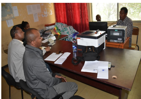
Seed sector performances and challenges survey conducted in east and west Hararghe

To improve seed quality and value addition, the project explored the mechanism by which the idle seed processing plant in Haramaya University (HU) can be used for seed processing in Hararghe, with the intention to provide service for SPCs. Following this, Chercher Odabultum farmers' cooperative union was identified as potential partner for providing the service. In doing so, an agreement was reached with top HU officials to donate the plant to Chercher Odabultum farmers' cooperative union. Currently, the process of transferring seed processing plant from Haramaya University to Chercher Odabultum Farmers' cooperative union was completed and installation work is underway.