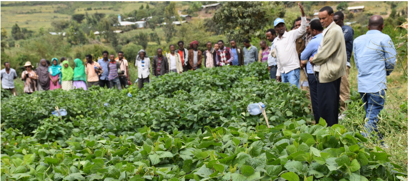
Guyyaa ayaana Qonnaan bultootaatiin muuxannoo yaalii sanyii hirmaachisaa qooda fudhattootaaf qooduu, Aanaa Doobbaa, Araddaa Leenca Waddeessaa

Pirojeektii BENEFIT-ISSD damee Oromiyaa bahaa, Yuunivarsiitii Haramaayaa