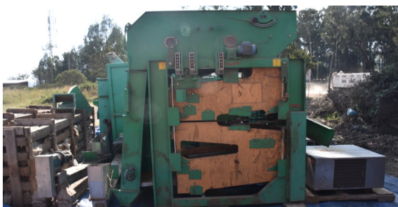
Maashina sanyii qulqulleessu fi soru yuuniyeenii Carcar Odaa Bultumiif tolaan deeggaramera

Sirna sanyii Harargee keessaa, keessattuu qulqullinaa fi sona sanyii fooyyessuuf, pirojeektiin ISSD carraawwan jiran erga xiinxale booda, haala ittiin maashinni sanyii soruu fi qulqulleessu Yuunivarsitii Haramayaa keessatti argamu hojjiirra ooluratti geggeesitoota yuunivarsitichaa olaanoo wajjiin marii taasiseera. Haaluma kanaan, maashinichi deeggarsaan qaama tajaajila waldoota Oomishtoota sanyiif kennuu danda'uuf akka kennamu waliigalameera. Kanaafiis, miiltotni tajaajila waldoota sanyii Oomishaniif kennuu danda'an adda bahuudhaan, yuuniyeeniin Carcar Odaa Bultum filatameera. Yeroo ammaa walharkaa fuudhinsi maashinichaa Yuunivarsiitii Haramayaa fi yuuniyenicha giddutti kan raawwate yoo ta'u, hojiin maashinicha dhaabuu geggeeffamaa jira.