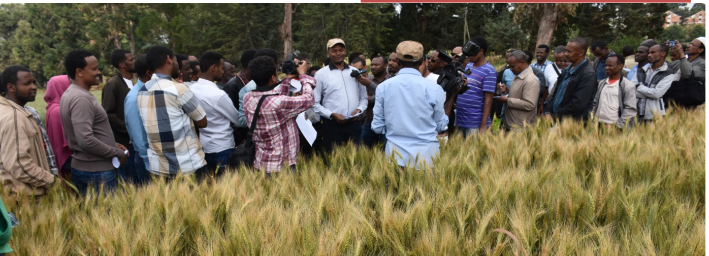
Guyyaa Ayyaana daawwii dirree walitti hidhata dhiheessitoota sanyii haadhoo fi waldoota Oomishtoota sanyii gidduutti cimsuuf Yuunivarsiitii Haramaayaatti qophaa'e