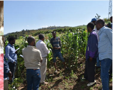
Stakeholders field day organized at Doba wored, Walkituma Waji Kebele