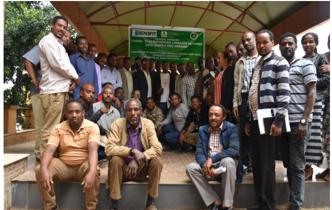
Waltajjii marii sadarkaa naannootti magaalaa Harar, Hoteela Raasitti qophaa'e