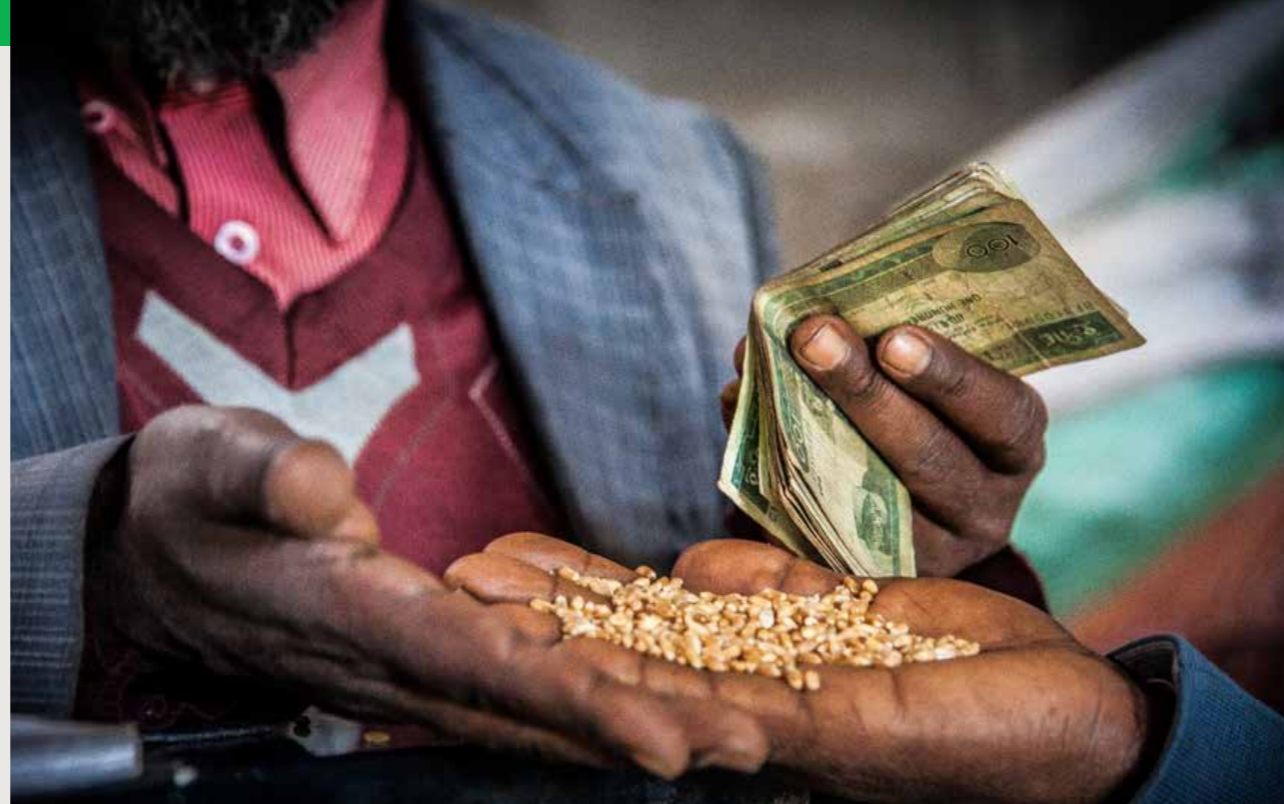
Direct seed marketing increases companies' accountability to farmers by bringing the two more closely together

In its early days, ISSD Ethiopia conducted a study of seed quality and recommended the establishment of independent seed regulatory authorities to enforce regulation and to enhance the delivery of public services to the sector, including seed business licensing, seed quality inspection and testing for seed certification, and seed quarantine. Subsequently, independent authorities have been established in the regional states of Amhara, Oromia and SNNPR, and the capacities of relevant departments within the MoA and the Tigray BoA have been strengthened.