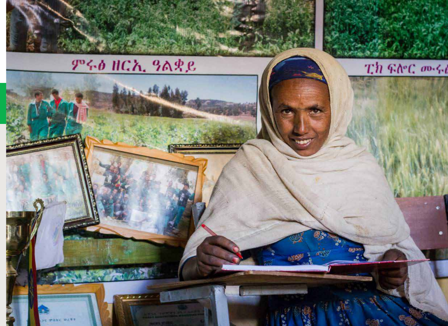
Systemic change requires adopting new ways of doing business

The transition towards a more competitive and sustainable sector requires a holistic and coordinated strategy for aligning production, service provision, markets and sector governance. This necessitates seeing the bigger picture. Introducing some successful innovations, or creating 'islands of success', is not enough to achieve wide-reaching impact in food systems. To improve the performance of the seed sector as a whole, partnerships among multiple stakeholders, and possibly disruptive change, are needed. ISSD Ethiopia did well to focus its narrative on systems, systemic change, the root causes of stubborn problems of the seed sector, and stakeholders' mental models (see Kania, Kramer and Senge, 2018), and to raise the ambitions of