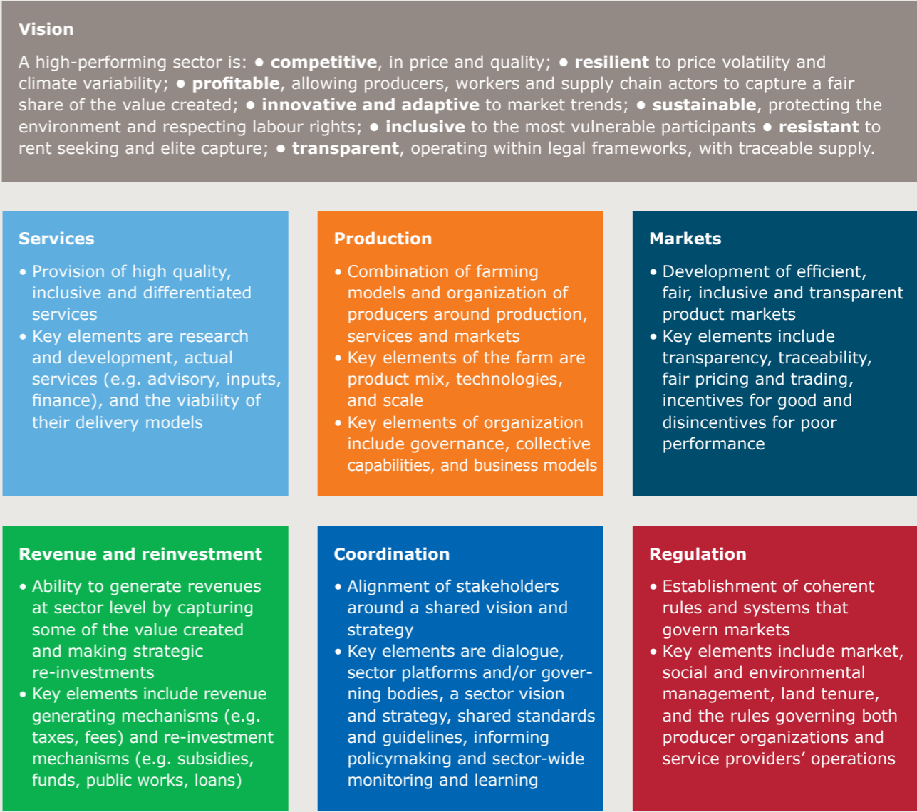
Figure 2: Model of the seed sector and description of its six functions (adapted from Molenaar et al., 2017)

The model also emphasizes the importance of having a vision of the future as the point of departure when developing a strategy for seed sector transformation. It is the vision from which key performance indicators are derived, for example regarding the sector's competitiveness and sustainability. Having a long-term vision helps to shift the focus beyond today's problems and short-term problem solving. As Section 3 discusses, this proved to be important to ISSD Ethiopia when facilitating the fifth stage of multi-stakeholder engagement: Convergence.