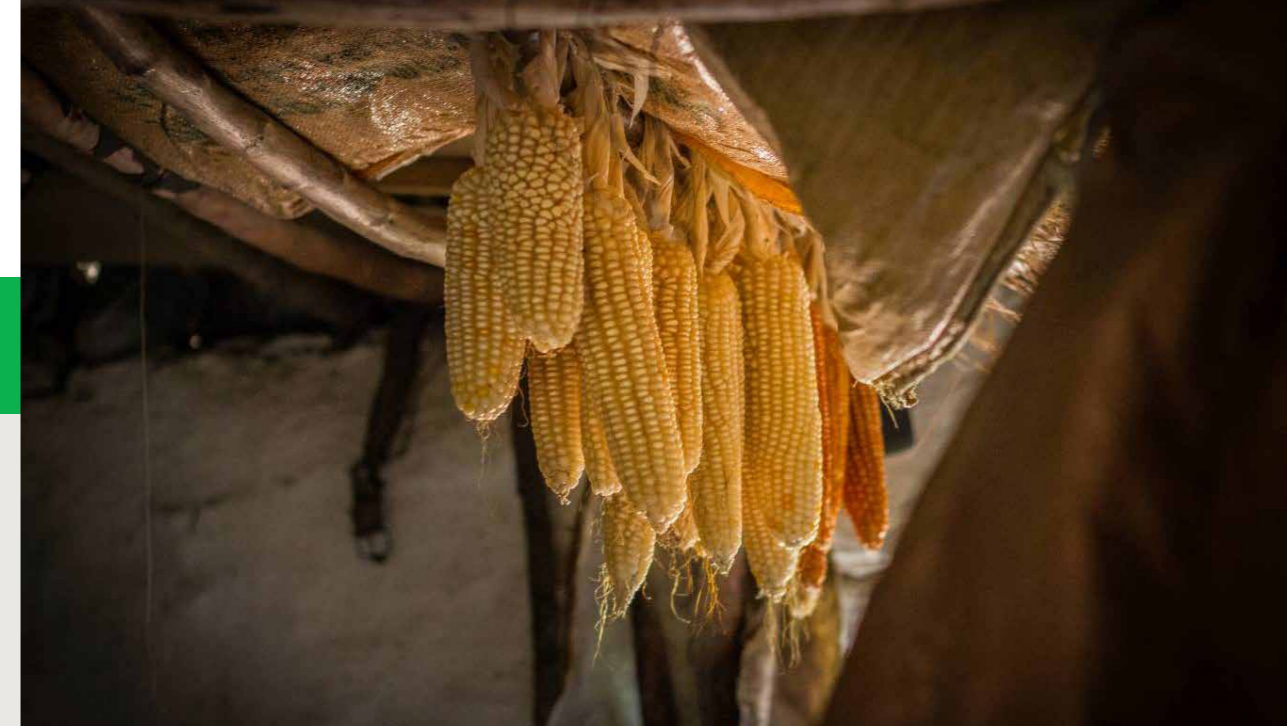
Farmers frequently save, share and exchange seed informally at local markets

At this stage, stakeholders can articulate their understanding of the issue and create a solid knowledge base that participants can use to start developing solutions. It is important to recognize individual capacity gaps that need to be addressed so that everyone can participate meaningfully. Common ground between stakeholders should be emphasized at this stage to instil a sense of common purpose by sharing information and creating a new 'container' together.