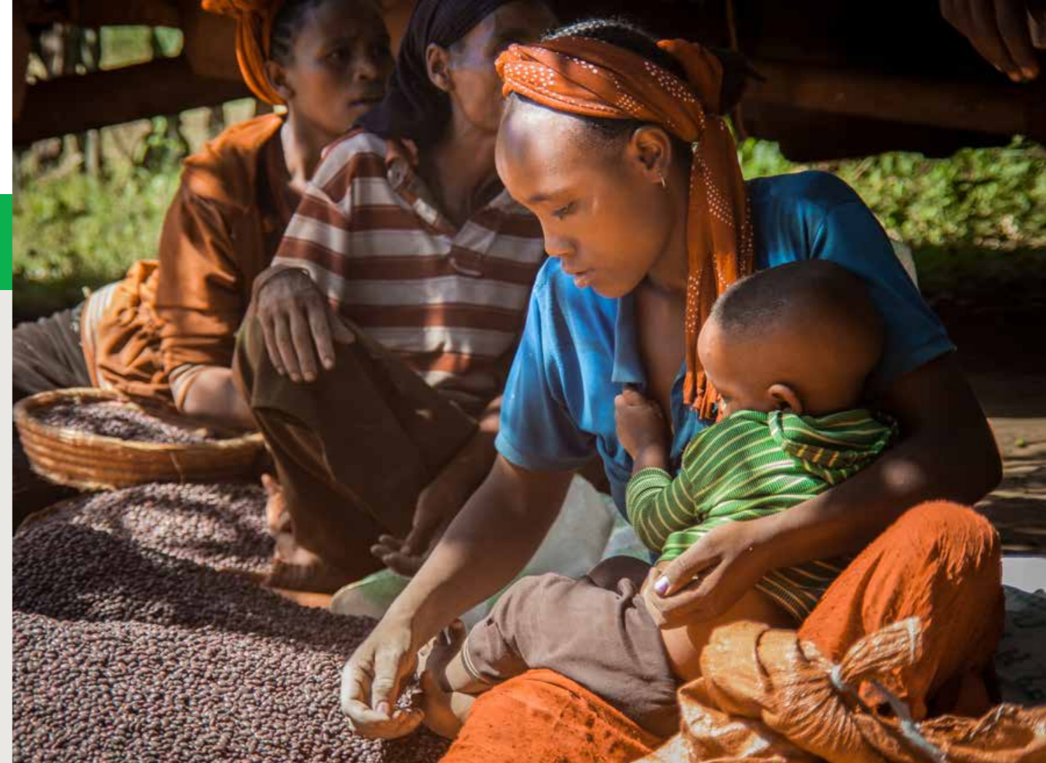
Women grading beans for the selection of seed to be saved for the next season

the late 1970s that formal seed production began. In 1979, what is now known as the state-owned Ethiopian Seed Enterprise (ESE), was set up to supply seed primarily to state-owned farms, but also to farmers' cooperatives and settlement areas. Until then, seed was multiplied through outreach programmes of agricultural research centres and selected colleges. Seed multiplication expanded in the 1990s in response to growing demand from government extension programmes (AGP, 2009). This was also very much supported by the World Bank Seed Systems Development Project (World Bank, 2003), which strengthened the commercial orientation of the ESE, improved seed sector coordination, and introduced the seed certification system. Against the backdrop of increasing seed demand, the