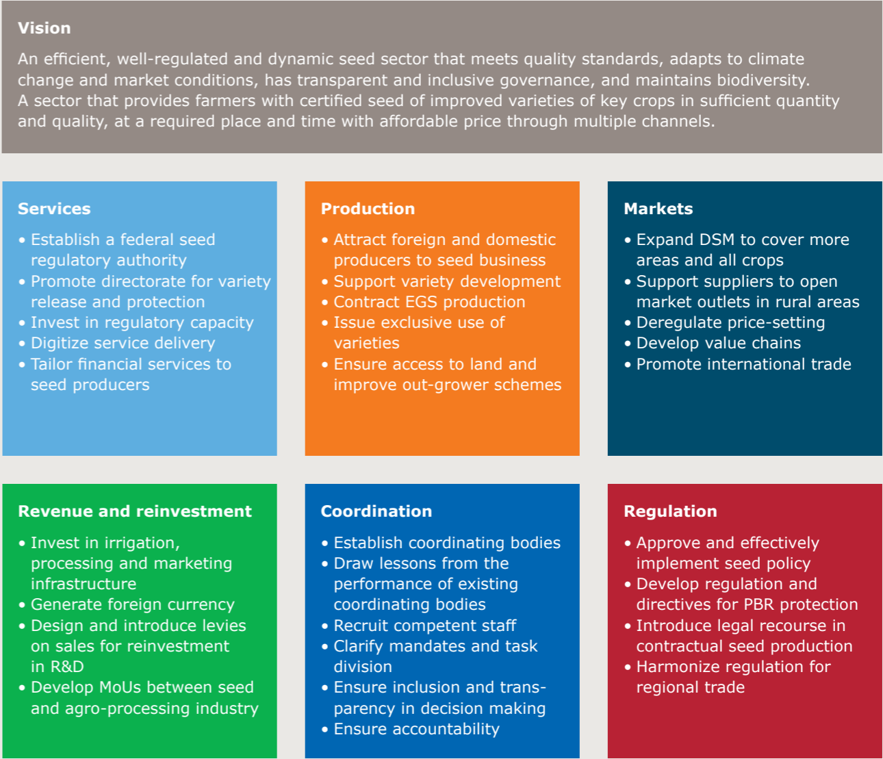
Figure 3: The transformation agenda across the six seed sector functions

Key: DSM – direct seed marketing; EGS – early generation seed; MoU – memorandum of understanding; PBR – plant breeders’ rights; R&D – research and development