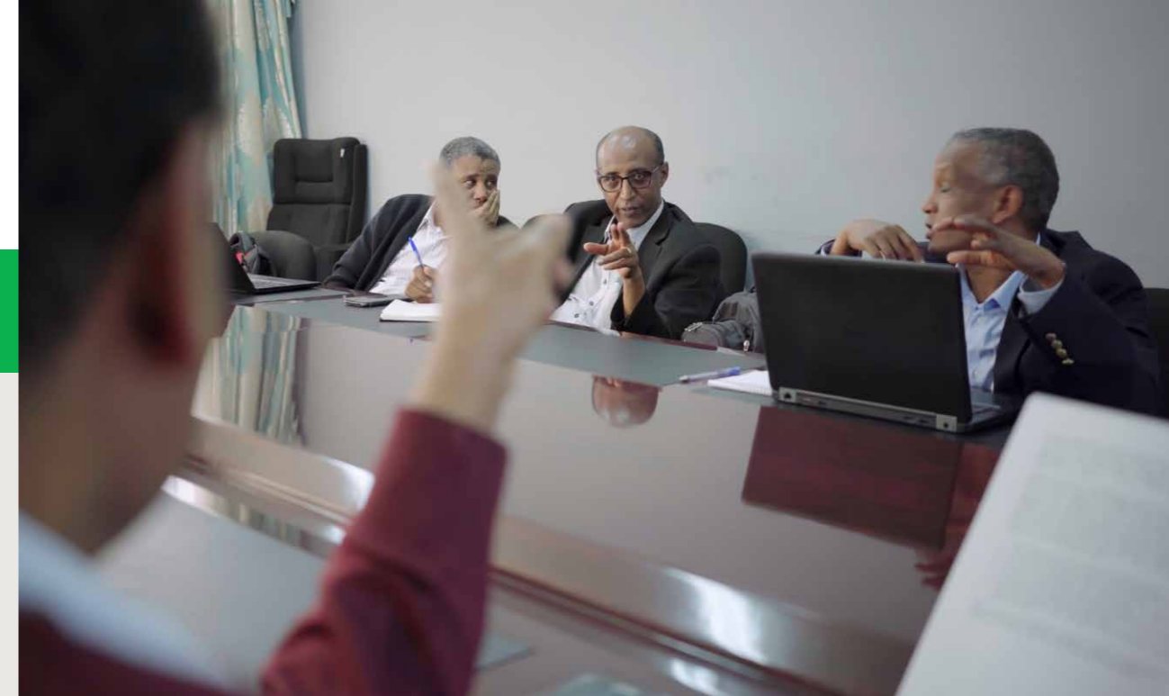
NSAG members debating the way forward

The objectives cited in the agreement between the MoA and ISSD Ethiopia can be summarized as facilitating greater involvement of multiple stakeholders in identifying, prioritizing and overcoming key challenges in the seed sector. The MoA requested the secondment of a senior expert to help achieve this. As there is no specific directorate within the ministry dedicated to seed, ISSD Ethiopia's senior seed sector expert was deployed to the so-called Seed Unit, an ad hoc taskforce comprising senior civil servants, advisers to the state ministers and a seconded staff member from the ATA, with the mandate to improve seed sector performance. In accordance with the agreement signed with the MoA, one of the major tasks of the seed expert was to facilitate the work of a soon-to-be-established advisory group. This group, the National Seed Advisory Group (NSAG), was established in the second half of 2017 to advise the MoA on strategy and policy,