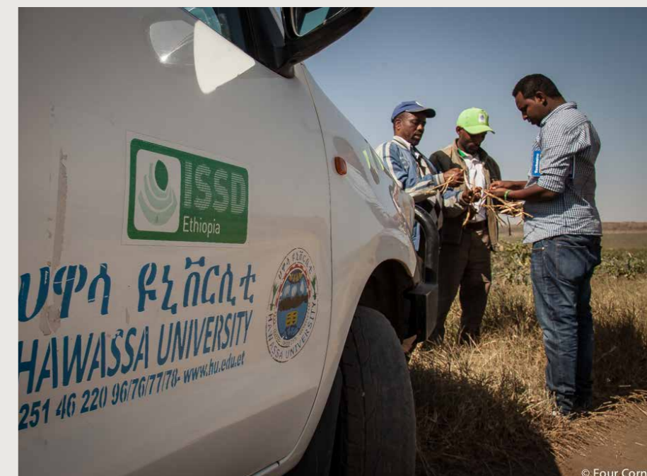
ISSD Ethiopia seed expert consulting farmers on good agronomic practices

A strategy that greatly contributed to the above achievements was the establishment of regional seed core groups in the four regional states where ISSD Ethiopia operates (Hassena, 2017). These are groups of selected key decision-makers in the regional state arena, including deputy heads of the BoAs, directors of research institutes, representatives of public and private seed producers and farmers' organizations, and coordinators of multi-/bi-lateral seed-related projects of NGOs. The function and intended purpose of these regional core groups is the collaborative governance of the seed sector. Members jointly formulate interventions aiming to overcome strategic challenges of the seed sector, and coordinate developments by facilitating partnerships for innovation, channelling financial and technical resources into interventions, monitoring and supporting interventions, and embedding successful interventions in the working practices of seed value chain actors.