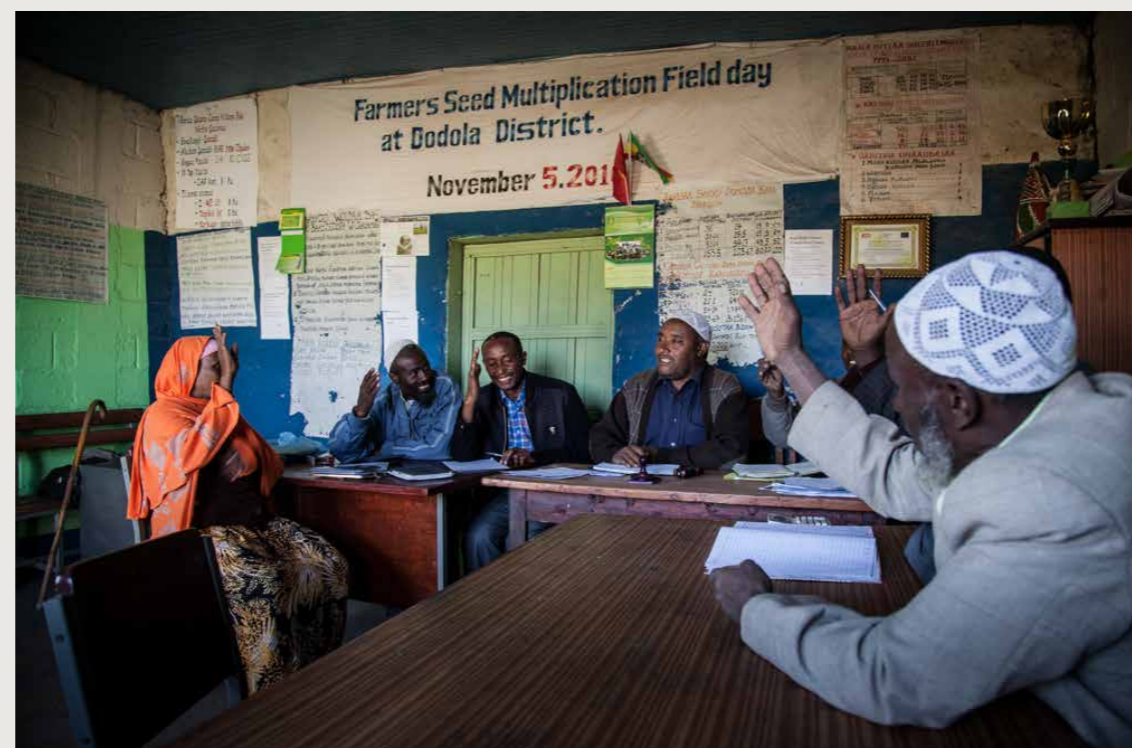
Manage not only adaptively, but inclusively